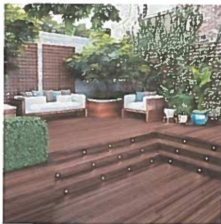
Design & Plan Your Deck